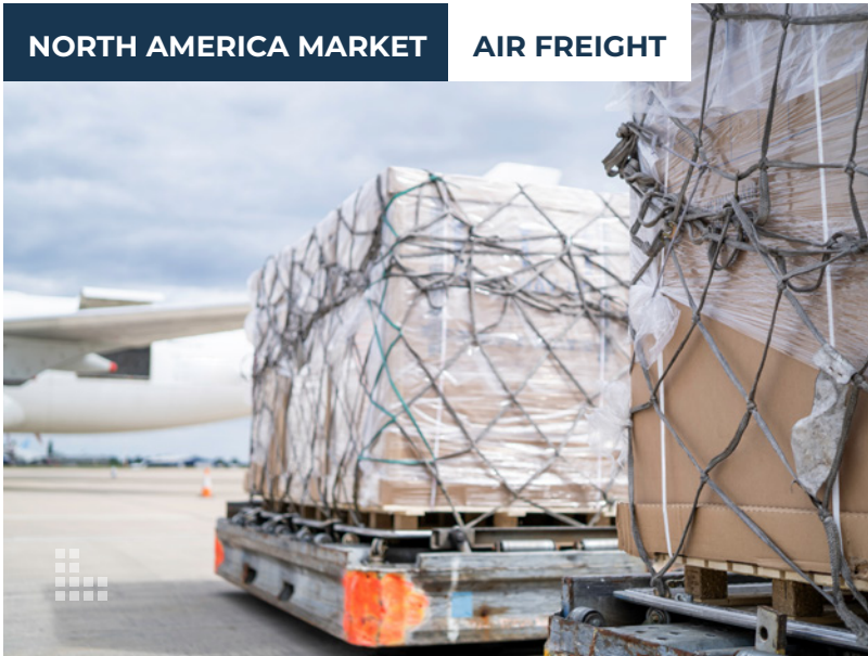
NORTH AMERICA MARKET

Source: Gallagher, J. (2025, November 20). Air cargo faces overhaul to comply with new CBP rule. FreightWaves. https://www.freightwaves.com/news/air-cargo-faces-1bn-overhaul-to-comply-with-new-cbp-rule