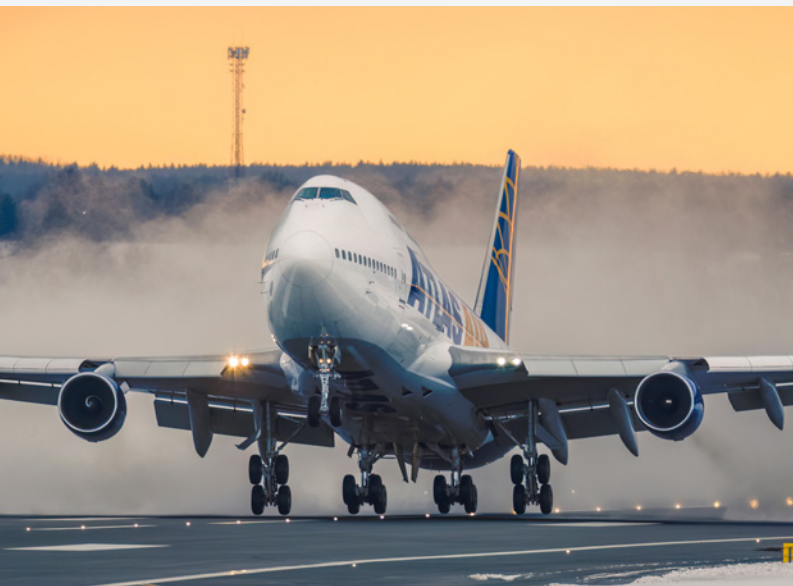
NORTH AMERICA MARKET