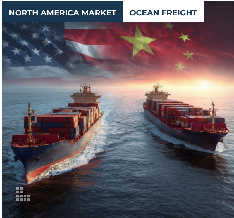
NORTH AMERICA MARKET