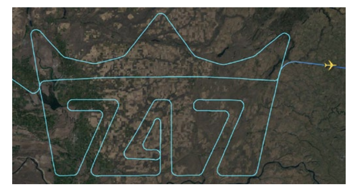
In a fitting tribute to the last B747, the inaugural Atlas Air flight drew the above "Sky Art" over Eastern Washington. It took 2 hours and 35 minutes to create.

The Boeing 747, long considered as the "Workhorse" of cargo fleets, is preferred by many due to its versatility. Factory-built B747s, with their nose and side door capabilities, large payload and capacity, and long-range, make the aircraft a firm favorite with the air cargo sector, with many lamenting the end to its production.