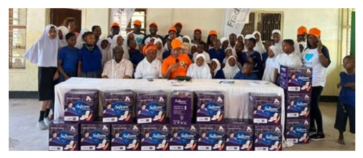
of ensuring a violence-free society and promoting equal education opportunities for all.

On November 30<sup>th</sup>, 2022, Fracht Group-Polytra Tanzania teamed up with the 16 Days of Activism campaign to combat gender-based violence. Polytra Tanzania participated by providing educational resources and sanitary pads to the Uhuru Mchanganyiko Primary School in Dar es Salaam. By doing so, Polytra Tanzania aimed to reduce the number of girls who we're missing school due to not being able to afford sanitary products. This initiative aligns with the goal